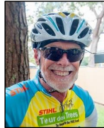
Rideout: $ 13,770